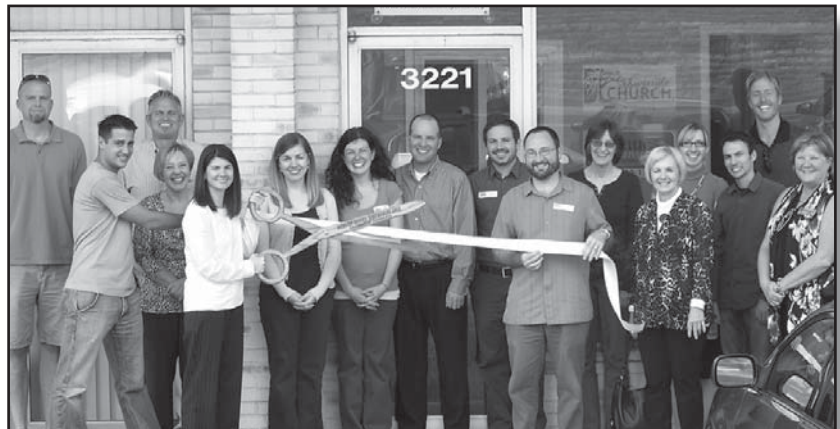
Avenues Counseling Center 3221 Brentwood Blvd, Suite 211