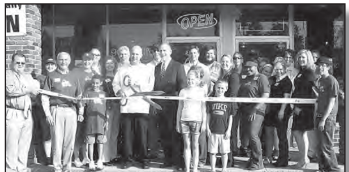
St. Louis Wing Co. 9816 Manchester Rd. ~ Rock Hill